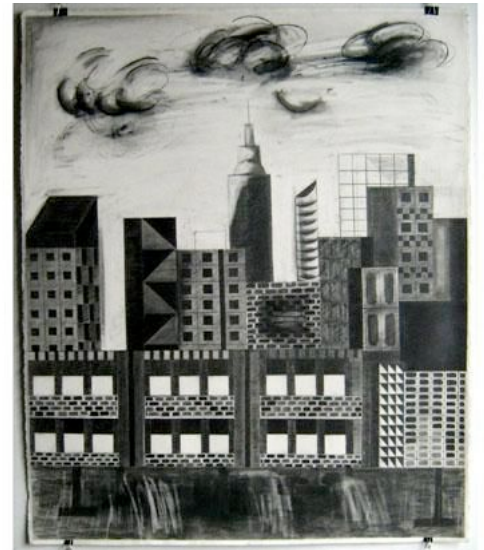
Untitled (Cityscape #30) Charcoal, graphite 51 x 42, 2008