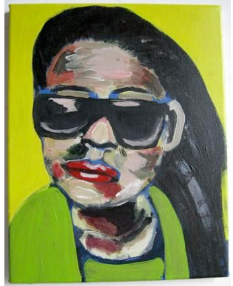
"Urban Grid, Riffs on the Grid" 2009 detail 11 x 14, 2009