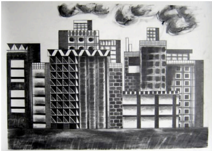
"A Redefining Fine" Graphite, Charcoal 22 x 30, 2009