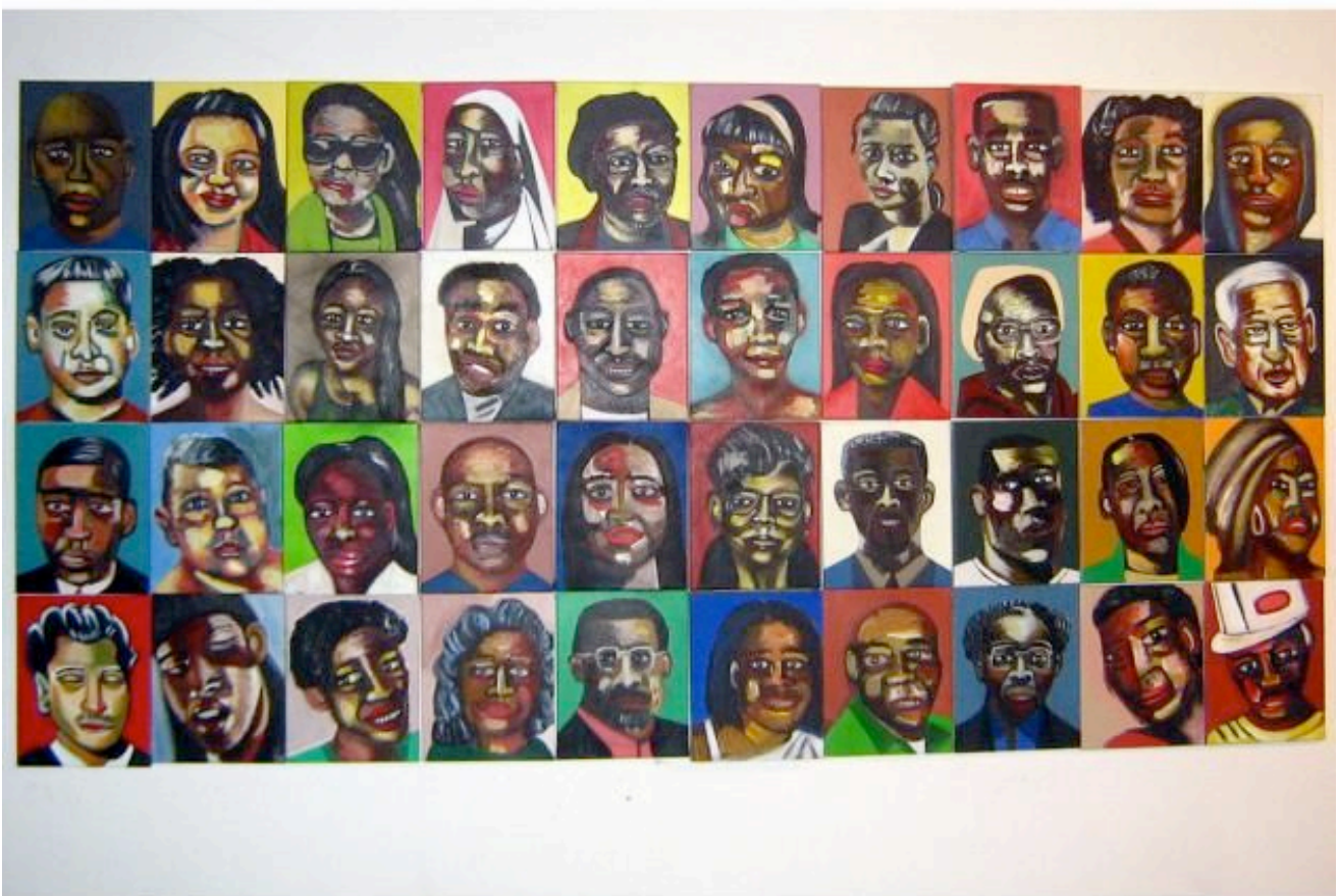
"Urban Grid, Riffs on the Grid" 2009 Group of 40 acrylic painting 11 x 14 ea based on photographs