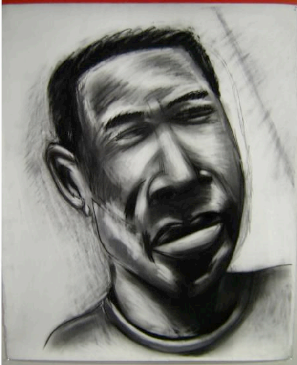
Inspired by Carravaggio's "Boy Bitten by Lizard", Charcoal, graphite 51 x 42