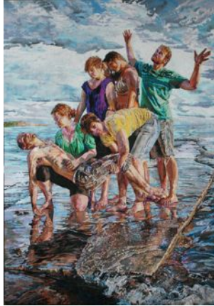
Jeanne C. Finley + John Muse, MC 5 , charcoal & graphite on vellum, 40 x 50 inches Jamie Vasta, Deposizione , 2011, glitter, glue on board, 84 x 72 inches