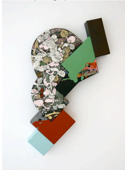
"No Right To Be Left", 2010, oil, acrylic, alkyd resin on canvas, 23 x 13.25"

At the heart of each picture are abstract "landscapes" built from gummy looking blobs of oil and alkyd paint. Wiped with ink to accentuate the crevasses that appear when the forms dry and shrink, these segments resemble aerial photographs seen without 3-D glasses.